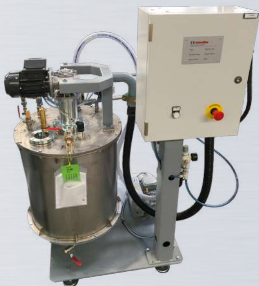
Detail: catalyst tank