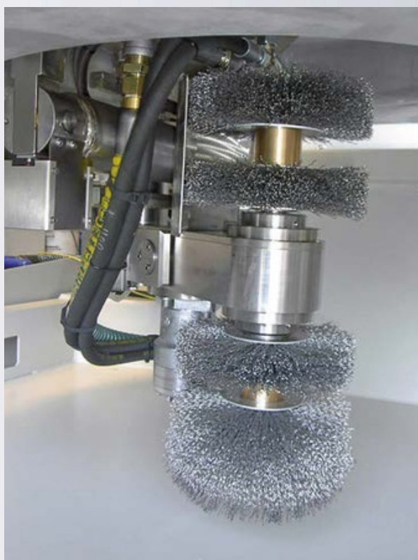
Bristled brushes in stainless steel (also available in phosphorous bronze and nylon)